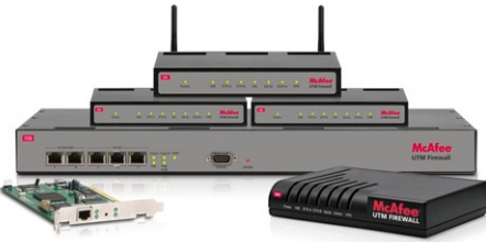
Figure 1: Enterprise-class security solutions tailored for the distributed environment and the small and medium-size enterprise.